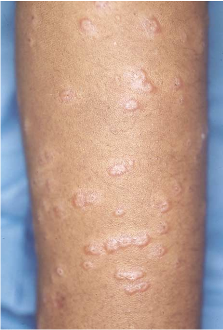
Fig. 1. Papular sarcoidosis on the arm.