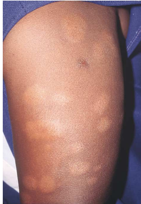
Fig. 3. Hypopigmented lesions in a patient with sarcoidosis.

ears [5,12,15]. The nose lesion can involve the nasal mucosa and underlying bone, leading to perforation [16]. It is the most characteristic skin lesion of sarcoidosis and is most common in African-American women [3,5,6,15]. The association of lupus pernio with upper respiratory tract involvement is well recognized, and includes the nasal and oral mucosa [17], larynx and pharynx [18], salivary glands [19], tonsil, and tongue [20]. It is often accompanied with pulmonary infiltration and fibrosis, chronic uveitis, and bone cysts [2,11]. Spontaneous remission of skin and systemic lesions is extremely rare [2].