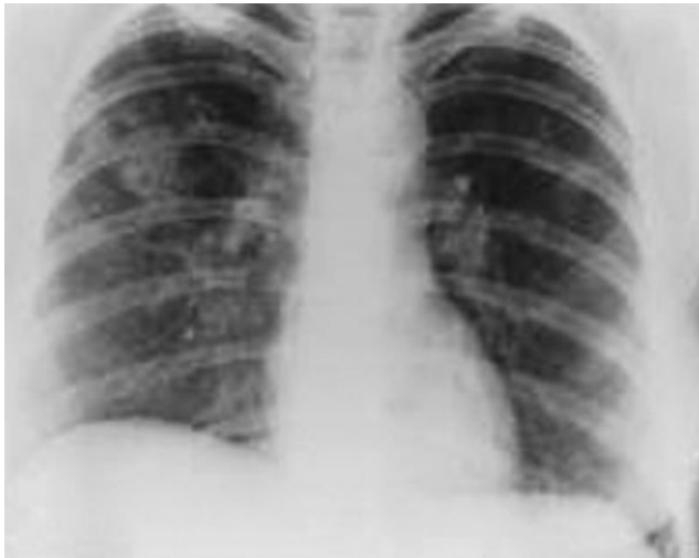
Figure 1 Posterior–anterior view of the chest X-ray shows bilateral hilar lymphadenopathy and cavities in a patient with sarcoidosis

Reported evidence indicates an immunological response resulting from one or a combination of factors mentioned above. The T-helper 1 (Th1) lymphocytes play a central role (Moller and Chen, 2002) in granuloma formation, which is thought to be the result of deposition of poorly soluble antigenic material in the tissue. This antigenic material is taken up by antigen presenting cells such as macrophages or dendritic cells, which then expose it to T-lymphocytes. In response to these antigens, a local amplification of the cellular immune reaction takes place. In addition, mononuclear phagocytes and other inflammatory cells migrate to the site of the antigenic deposition under the influence of the chemokines and cytokines produced by Th1 cells. This results in the formation of a granuloma (English et al , 2001; Moller, 2003).