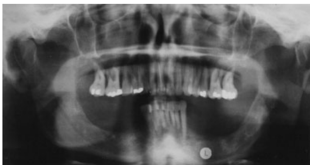
Figure 2 Panoramic radiograph showing generalized severe alveolar bone resorption in both maxilla and mandible of a patient with sarcoidosis